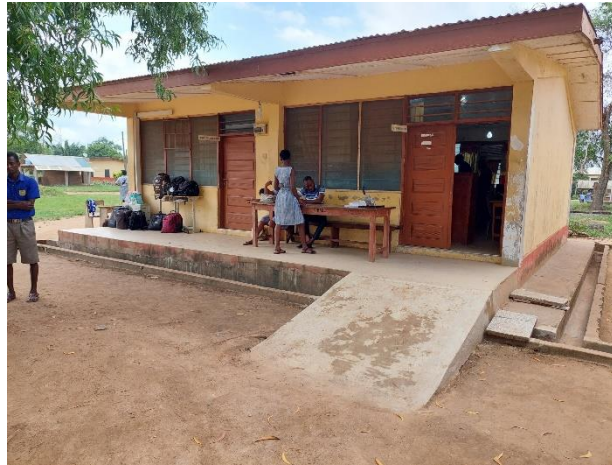
Current Resource Centre

The new extension will incorporate accessibility features like tactile floor finishes, a ramp with railing to aid in the independent and safe movement of the visually impaired students. Pictures of the existing and proposed extensions are shown below.