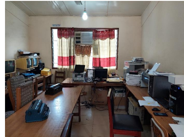
Proposed Extension and Upgrade